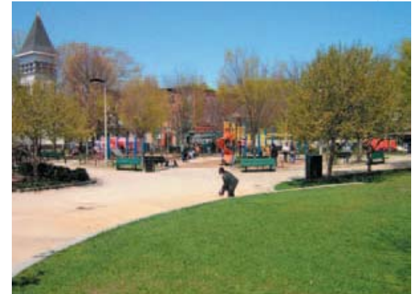
Mozart Park, often cited as a nighttime safety concern