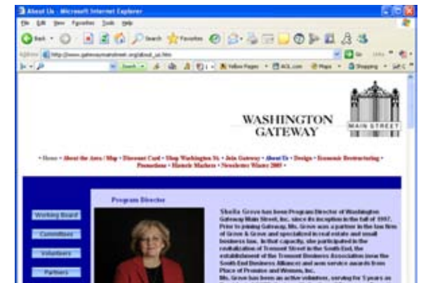
The Washington Gateway Main Street webpage provides staff biographies, which helps personalize the organization