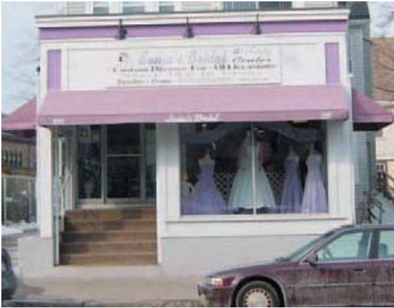
Sonia's Bridal Center

BusinessLINC Boston is a small business assistance program that connects neighborhood businesses to training, loans, and incubator space.