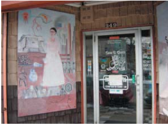
Tacos el Charo door

require staff time and some limited advertising. The Economic Restructuring Committee may take on outreach for this project. Putting together the basic agreement and questionnaire may be a suitable project for a student intern.