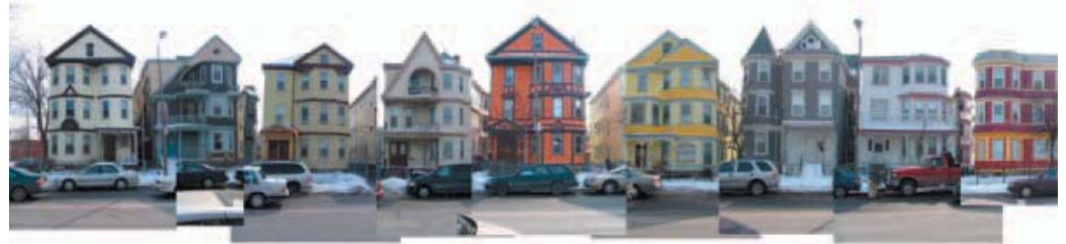
Before: Residential Buildings on the South Side of Centre Street between Mozart Street and Wyman Street

HJSMS recently produced a brochure entitled "HJSMS Business Development Priorities," which describes (in broad terms) some of the support