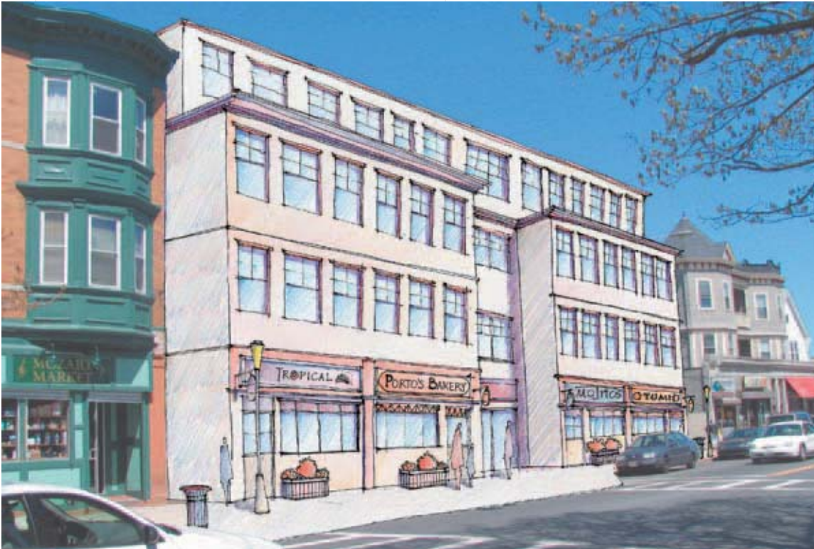
After: Vacant Lot across from Mozart Park