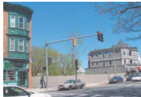
Before: Vacant Lot across from Mozart Park

uses should be as transparent as possible in order to promote visibility and prevent “dead spots” within the retail district.