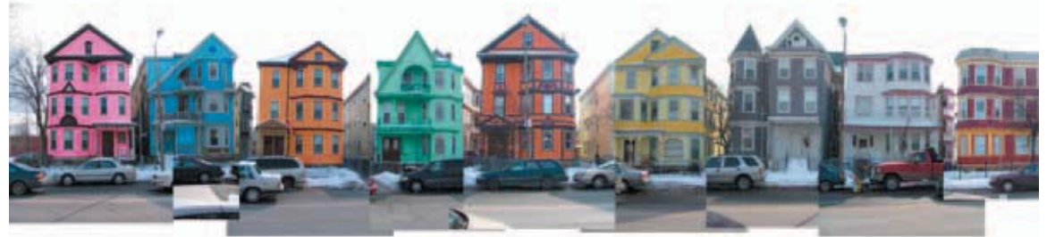
After: Residential Buildings on the South Side of Centre Street between Mozart Street and Wyman Street