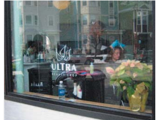
The Ultra Beauty Shop

The Organization Committee builds partnerships, raises funds, oversees financial management and budgets, and recruits volunteers.