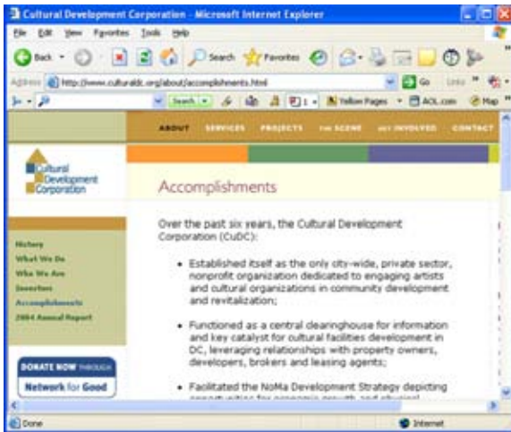
The Cultural Development Corporation effectively uses its website to publicize its accomplishments