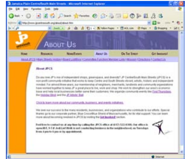
The JP Centre/South Main Street website explains committee functions and provides member lists

While HJS is a relatively small neighborhood with many interconnections between residents and employees, there are still people who know little about the staff of HJSMS. Because so much of a community organization's power to accomplish community goals comes from personal interaction and trust, there is great value in promoting the