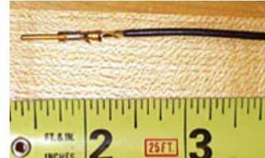
Wires with Pins

Molded plastic housing with 3-4-4-3 grid of holes and polarized locking collar