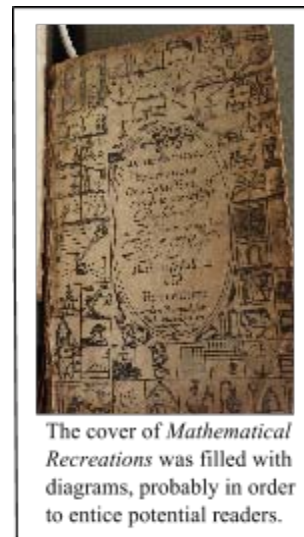
The cover of Mathematical Recreations was filled with diagrams, probably in order to entice potential readers.

admirable conclusions” (Leurechon, Mathematical Reflections , cover). The cover appealed to a wide audience, depicting the range of topics touched on in the book and calling them “useful and recreative.” Also to appeal to a layperson, Leurechon made a point of omitting detailed, technical explanations for the problems, stating in the introductory “By way of advertisement” section, “Those which understand the mathematics can conceive them easily; others for the most part will content themselves only with the knowledge of them” (Leurechon, Mathematical Reflections , “By way of advertisement”). Probably attempting to improve the casual reader’s experience, Leurechon switched rapidly between topics. Later editions of the book also included a table of contents, perhaps because the constant topic-changing made finding specific problems difficult otherwise. The reader certainly had the option of delving deeper into the science behind the demonstration, but Leurechon’s goal seems to have been to impress rather than to instruct. This appeal to a wide audience led to a commercial success: Mathematical Recreations went through over 30 editions by the end of the century 6 .