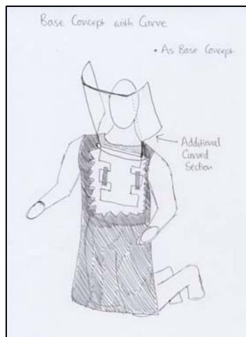
Figure 1: Basic-T

The next step in our product development was to use a set of criteria to narrow our concepts to the three most viable solutions. The criteria evaluated the design with respect to the issues outlined above, with each criterion evaluated on a scale of \pm 2 , and the concepts with the highest total score were chosen for further development. (Appendix C) The chosen concepts are shown below: