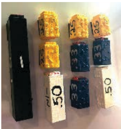
Figure 3. Prototype of altered fraction blocks to better employ UDL principles.

There do exist limitations in this use of technology; the braille makes the blocks inaccessible manipulatives for blind students who are unable to read braille. However, due to the differentiable size of the blocks, it may be possible for such students to be able to tell different sizes by touch, though they may not be able to know that a block represents \frac{1}{4} versus \frac{1}{3} without additional help from a group member or teacher.