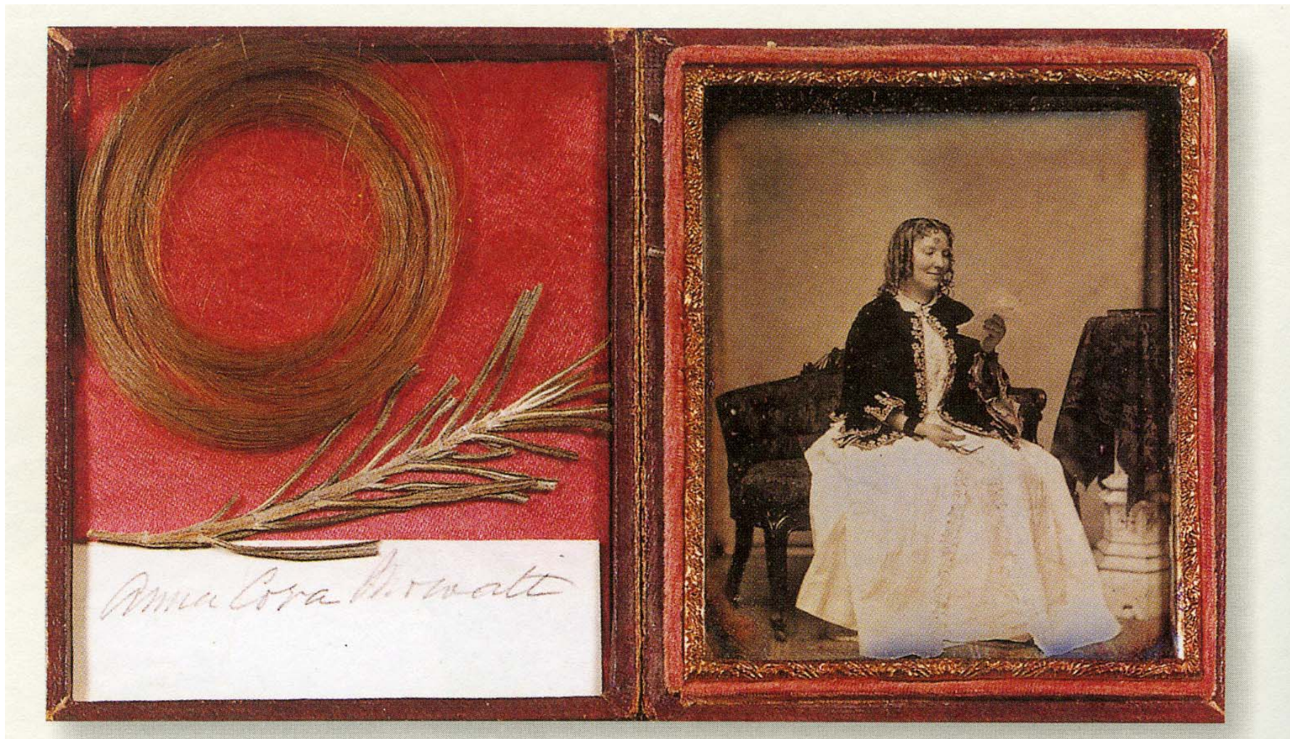
p. 72, Anna Cora Mowatt, c. 1855