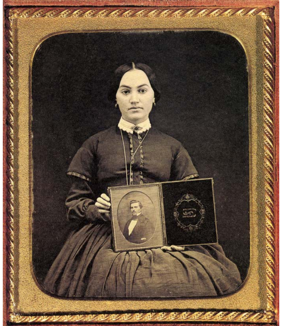
p. 99, Woman seated, holding a daguerreotype, c. 1850