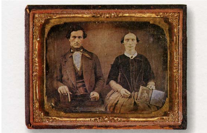
Frontispiece, Unidentified couple, woman holding a daguerreotype, c. 1850

Note: all photographers/makers are unknown unless cited.