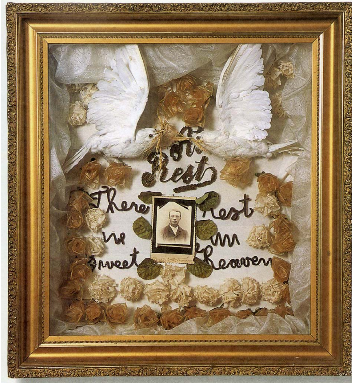
p. 83, Memorial to a young man, c. 1910