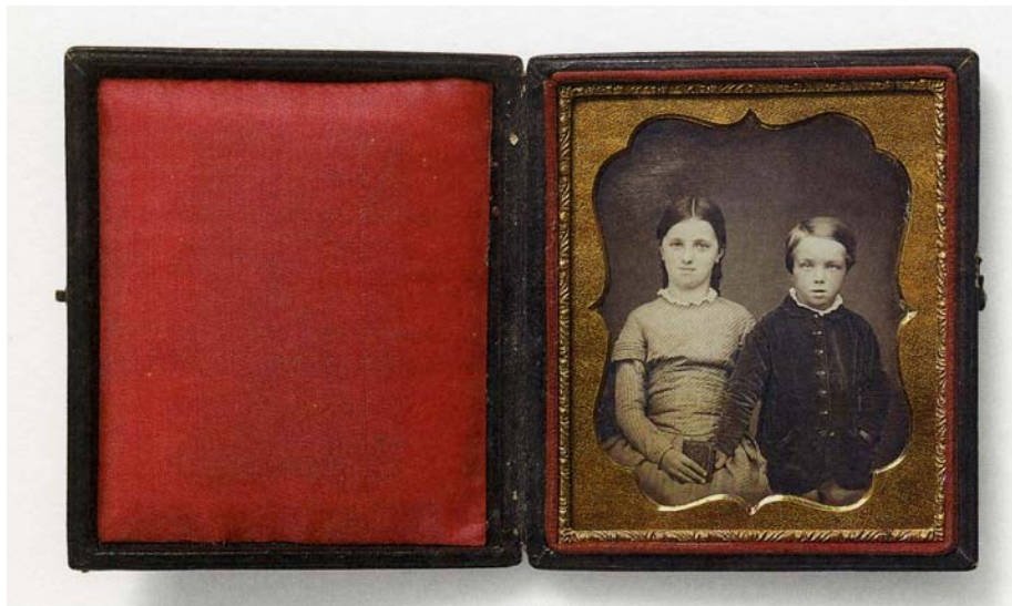
p. 13, top, Young girl and young boy; she is holding a daguerreotype case, c. 1855; bottom, Woman holding a daguerreotype case, c. 1850.