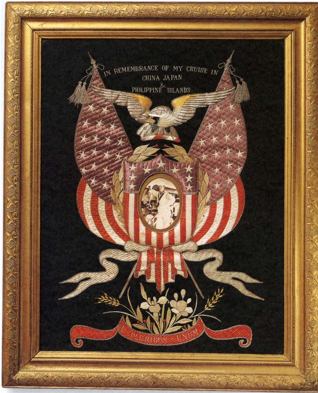
p. 45, Portrait of a young American sailor on board his ship , c. 1910.